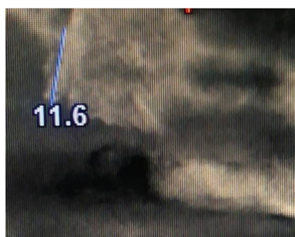
Figure 2. Width of pterygomaxillary process in axial plane.