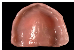
Figure 2. Anchored resin polymerization denture based.