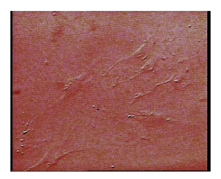
Figure 2. Using PCR analyzing, the gene expression of cytokeratin 18, skin cell-specific gene was examined.

Figure 1. Shows the cells 9 days after induction of differentiation.