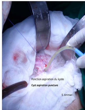
Figure 7: Intra-operative photo of the puncture and aspiration of the cyst