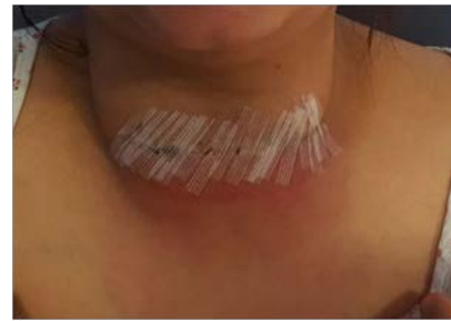
Figure 3. Postoperative Day 10.