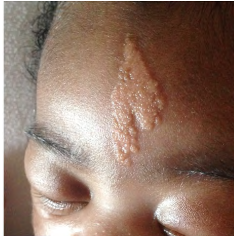
Figure 2. Yellow globules aggregated into clusters.