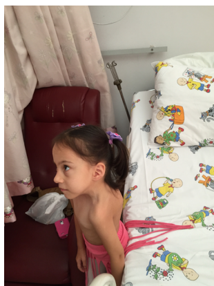
Figure 2. Facial asymmetry and concavity of the left side of the chest due to rib fusion anomaly in our type 3 KFS case.