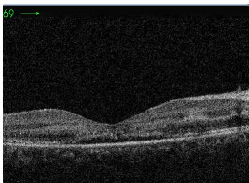
Figure 2. Dengue Associated Maculopathy.