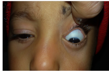
Figure 5. Healed phlycten at 6'o clock following antitubercular therapy.