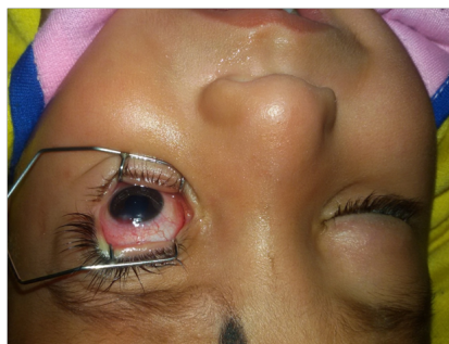
Figure 2. Phlycten with surrounding conjunctival injection at 6' 0 clock position.