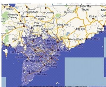
Saigon under 4 meters

The destruction of the nuclear plant in North Japan on 2011 resulted from the above process ! After this catastrophe, all the nuclear plants have been arrested for non function. But last month, the Sendai reactor is started again in service ! What a big danger!