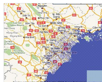
Hanoi ngâ.p 2 met