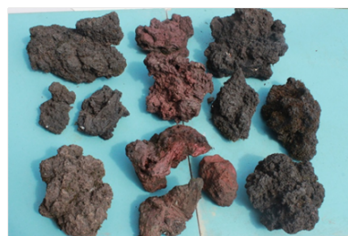
The rocks from other volcanoes were also analysed

Vietnam is relatively far from the cracks under the Pacific Ocean; its last volcano eruption and earthquake dated on 1923, at Island of Ashes SE of Saigon, while volcanoes at High-Dongnai, Low-Dongnai and Cu lao Re were in extinction very early in History.