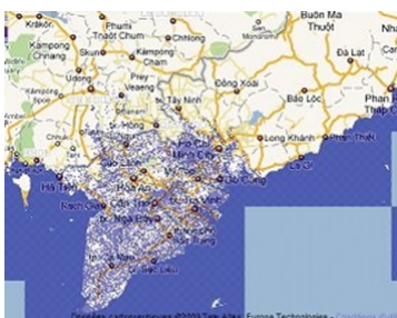
Saigon ngâ.p 2 mét