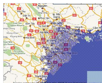
Hanoi under 4 meters