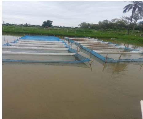
Figure 3. Fry counting.