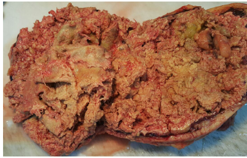
Figure 4. The cavity with textile fiber material inside.