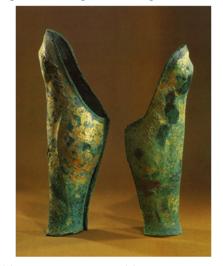
Figure 6. The greaves- Vergina Museum.

In my paper of 1986 [9] I proposed the hypothesis that the reason was a posterior dislocation of the knee, a result of a wound on