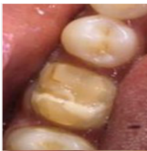
Figure 1. Pre-Operative Clinical Picture.