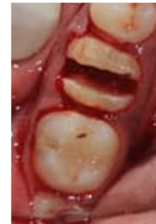
Figure 3. Hemisection Performed After Reflecting Full Thickness Mucoperiosteal Flap.