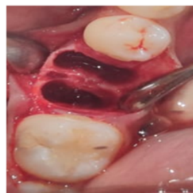
Figure 5. Intact Inter-Radicular Bone Post Extraction.