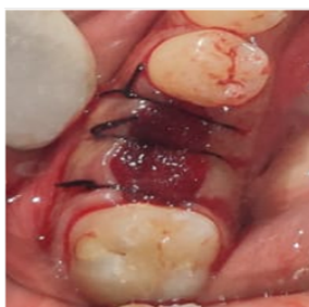
Figure 7. Interrupted Sutures Placed.