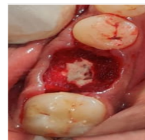
Figure 6. DFDBA Graft And Pericolol Membrane Placed.