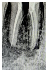
Figure 4. Radiograph After Hemisection.