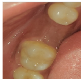
Figure 8. 3 Months Follow Up Clinical Picture.