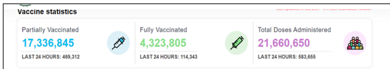
Figure 1. Vaccination Statistics of partially and fully vaccinated individuals with total doses administered in Pakistan.

A lot of measures like execution of awareness for hygiene, quarantining and isolation of the patients, ban on important entrance points, on borders for international routes, closing of amuse-