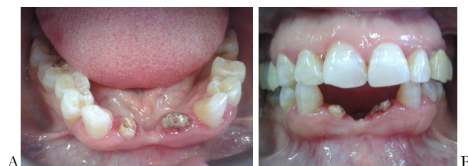
Figure 5. Longitudinal fracture at the level of 32.