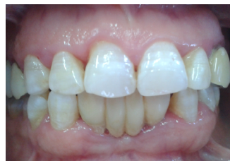
Figure 2. Ineesthetic aspect of the bridge.