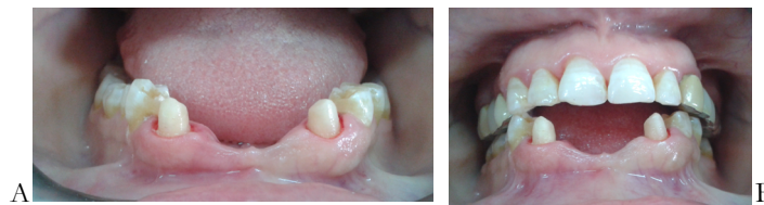
Figure 7 a, b. Temporary prosthesis in baked resin: note the excellent aesthetic integration.

Figure 6 a, b. Preparations of the supporting teeth (33 and 43) respecting the standard principles of all-ceramic prostheses.