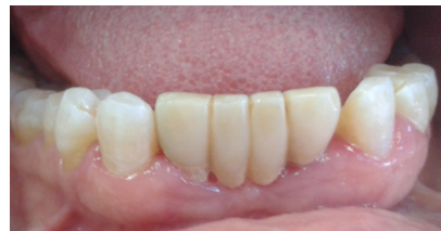
Figure 3. Note the accumulation of tartar and the too short length of the posts.