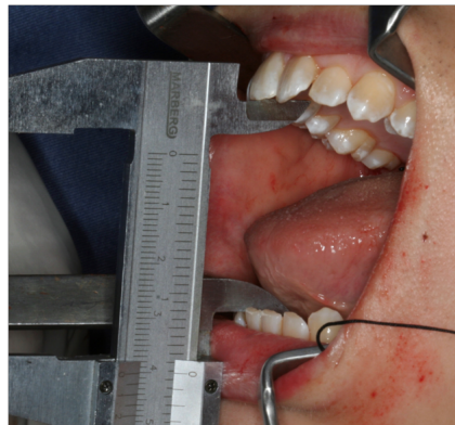
Figure 8. 5 years follow-up with satisfactory mouth opening of 35 mm.