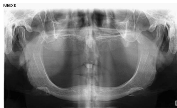
Figure 1. Severe Mandibular Bone Resorption in a 66-years-old Male.