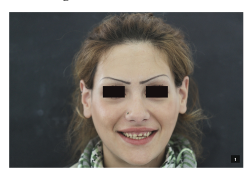
Figure 2a. Tooth exposure at rest, 2b. Smile line.