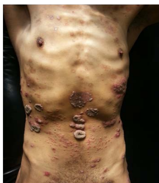
Figure 1. Multiples plaques, vegetating, papillomatous and smelly.