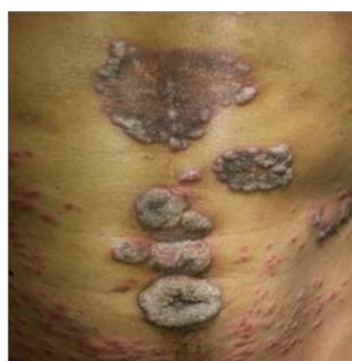
Figure 1a. Vegetating plaques involving the umbilical site.