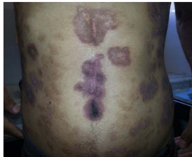
Figure 4. The patient is in complete remission.

The term pemphigus refers to a group of autoimmune bullous diseases of the skin and mucous membranes that have variable clinical and prognostic features [1].