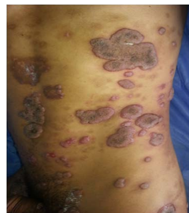
Figure 1c. Vegetating plaques involving the abdominal area