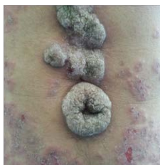
Figure 1b. Omphalitis.