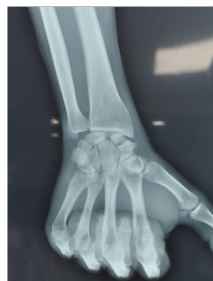
Figure 2. Postoperative control x-ray of a MATTY RUSSE procedure.